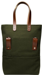
Bike bag /shoulder bag